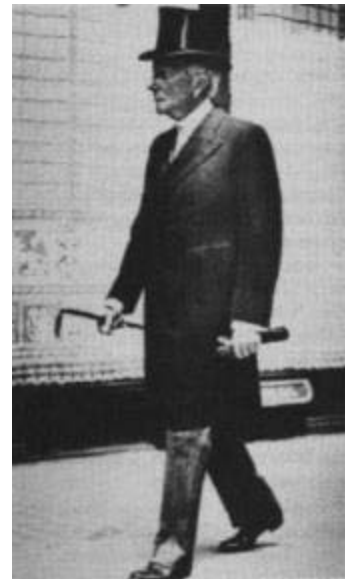
John D. Rockefeller. Sr.

Just as today as more and more women flock to female ob/gyns, the