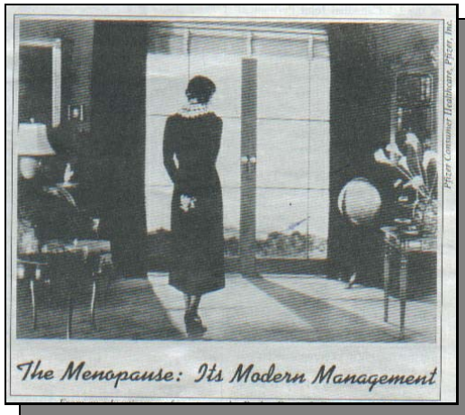
1937 Parke Davis Advertisement

Obstetrics and Gynecology profoundly changed after the publication of zoologist Kinsey's seminal tomes, the other being Sexual Behavior in the Human Female , and the legalization of birth control. The medical textbook publishers C.V. Mosby & Company published an Obstetrics & Gynecology text in 1958 with a chapter on the "sexual responses of women, dysmenorrhea, and premenstrual tension." In the 6 th edition published in 1979, their opening paragraph asserts that the "human female may respond to sexual feelings or sexual stimulation in varying degrees from infancy to death," a claim that finds its origins in the Kinsey Reports pedophile data. The next paragraph defines "normal sexual response" using the Kinsey Reports definition that "all outlets are equal." The medical text instructs the future physician, "This climax may be triggered as an autoerotic response or through heterosexual or homosexual stimulation." At the heart of this drastic change from modesty and motherhood to sexual recreation was the introduction of birth control. The textbook on Gynecology explains: