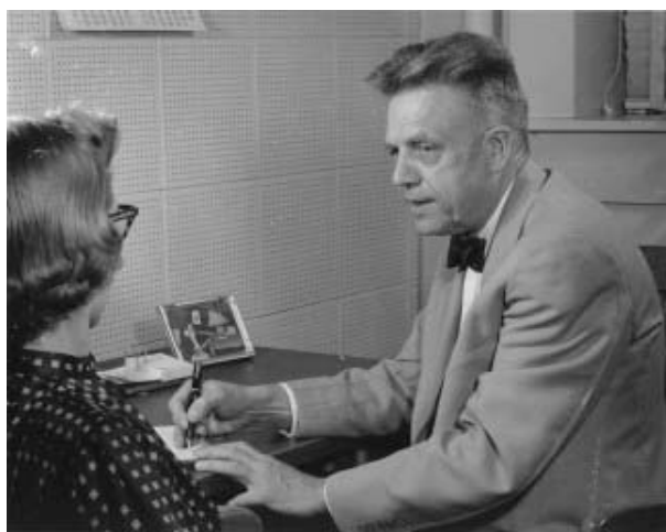
Indiana University's Dr. Alfred C. Kinsey, taking a sex history.