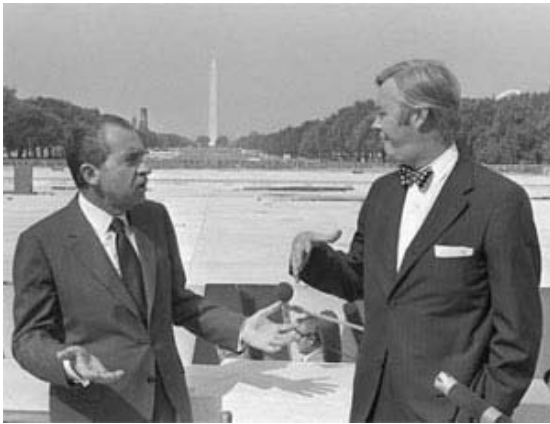
President Richard Nixon and Daniel Patrick Moynihan

Elite-driven policy successes began to realize gains, but the first breakthrough of the population controllers in making government a partner came during the New Deal, when Congress approved the Venereal Disease Control Act of 1939. Then with sporadic, yet consistent advancement through ensuing administrations, finally the Family Planning Services and Population Research Act--crafted by Daniel Patrick Moynihan and other members of the Nixon team and then legislatively shepherded by Congressman George Bush--became law in 1970. It sharply expanded federal expenditures for